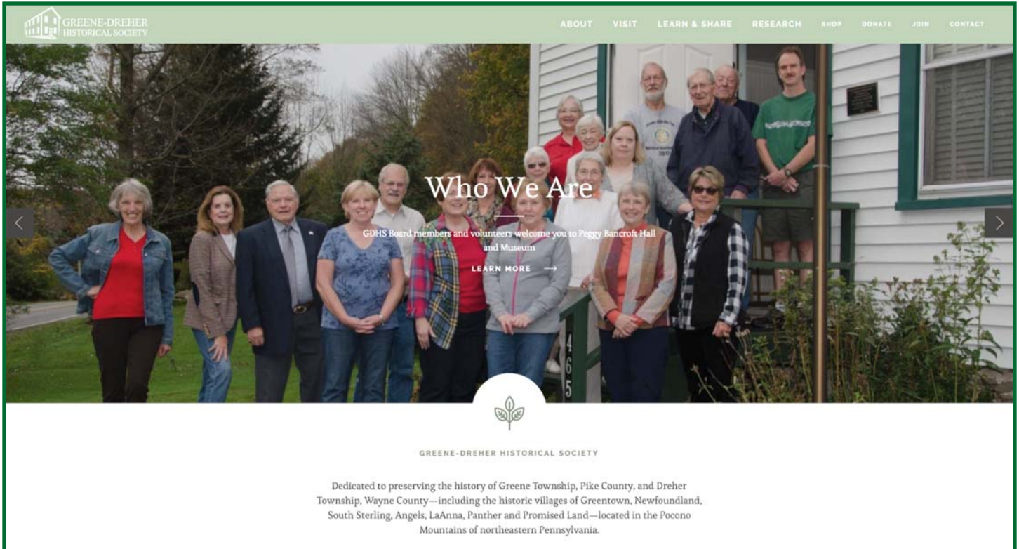
Above is an excerpt from the homepage of the Society's newly designed website.